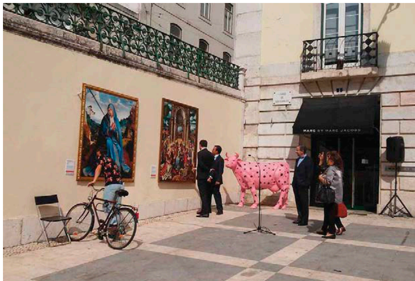
Figure 3. Exhibition "Coming Out. What if the museum went out?" 2016, National Museum of Ancient Art, Lisbon.

A "liquid museum" is, therefore, an institution with porous borders and as such, clearly relational: a dynamic force that refuses any institutional rigidity and seeks to organize multiple "capacities, opinions, values and experiences and different rationalities, technologies and techniques that enable their action" (Cameron 2015, 357).