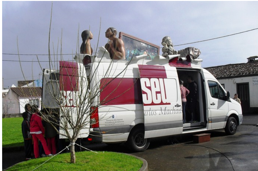
Figure 2. "Mobile Museum" project. Carlos Machado Museum, Azores.

corresponds to the constant updating of the practices, techniques, theoretical foundations, and ideological aspects of the institution (Figures 2 and 3).