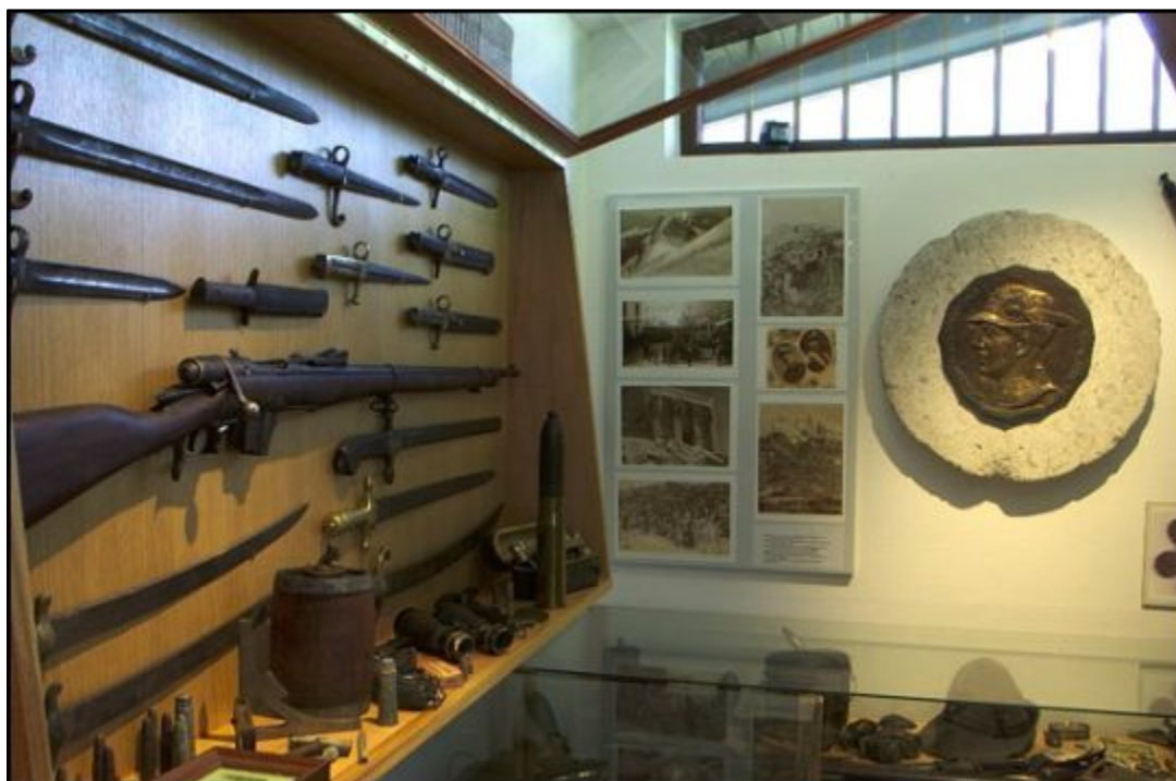
Figure 4. Alberto Picco. Lenarčič, M. (2004)

A large group visit is generally not advised due to spatial limitations. The private collectors keep their collections in their own homes, in garages, attics, outbuildings, or storage units connected to the house. Occasionally they are required to refuse guests because the tour and general communication is not possible due to the restricted size of the space. Problems with the dimensions of corresponding rooms are also responsible for how exhibits are assembled. Frequently, the expansion of a collection is not possible. Some private collectors decided not to collect bigger items at the outset of building their collections, even though larger objects could complement other artefacts. Like the museum, private collectors choose to acquire new military remains that would be most effectively included in the permanent display.