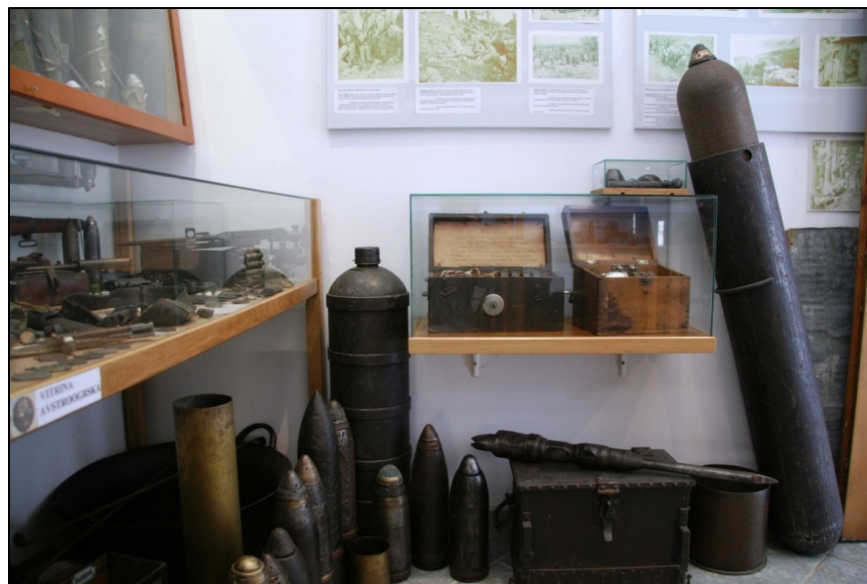
Figure 2. Gas Mortars. Bizjak, M. (2015)

There are many private collectors of WWI objects in Caporetto County, although only seven 5 have opened their collections to the public. All seven collectors are men. However, many of them noted 6 that their whole families frequently participate in the so-called “treasure hunts” to locate new objects, so women are not excluded from collecting. Nonetheless, these collectors play an important role in Slovenian and world museology by maintaining, researching, and promoting the cultural heritage of the area. In Slovenia, the phenomenon of openly collecting war remains emerged in the 1990s with the country’s independence. The private collectors mentioned above are unified in stating that they expanded their collecting at that time due to heightened awareness, sense of belonging, and recognition of the past. At the same time the Kobarid Museum opened, which gave the private collectors a sense of being “on the right track” with their collecting habits. If these wartime remnants were not collected, memories would fade away. By collecting the military objects, these collectors are helping to preserve the challenging remembrances of the events of Isonzo region.