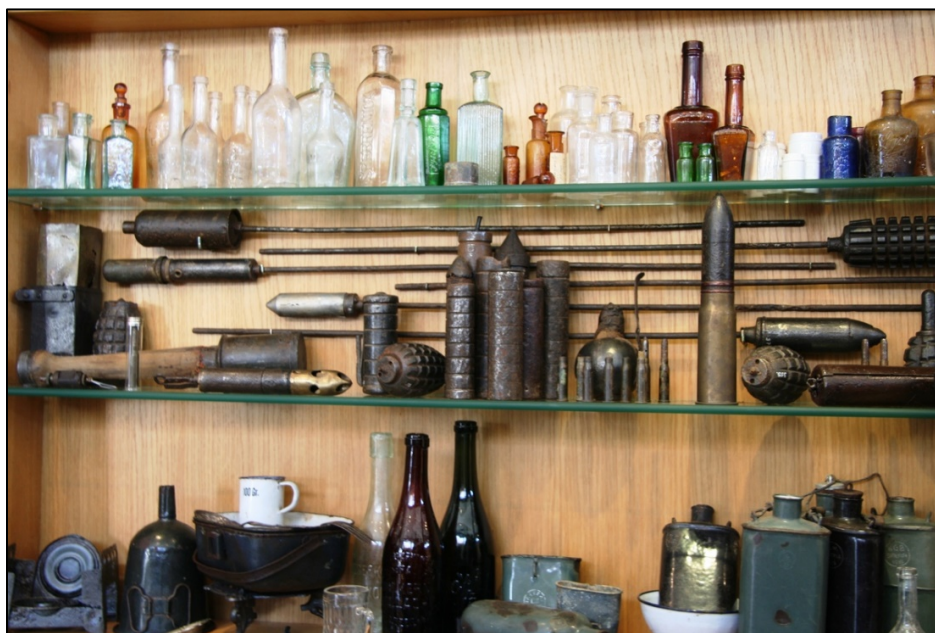
Figure 1. Alcohol and medicine bottles, and other military artefacts. Bizjak, M. (2015).

memories from the area. Private collectors contribute context through communication and by framing of the events through their collections.